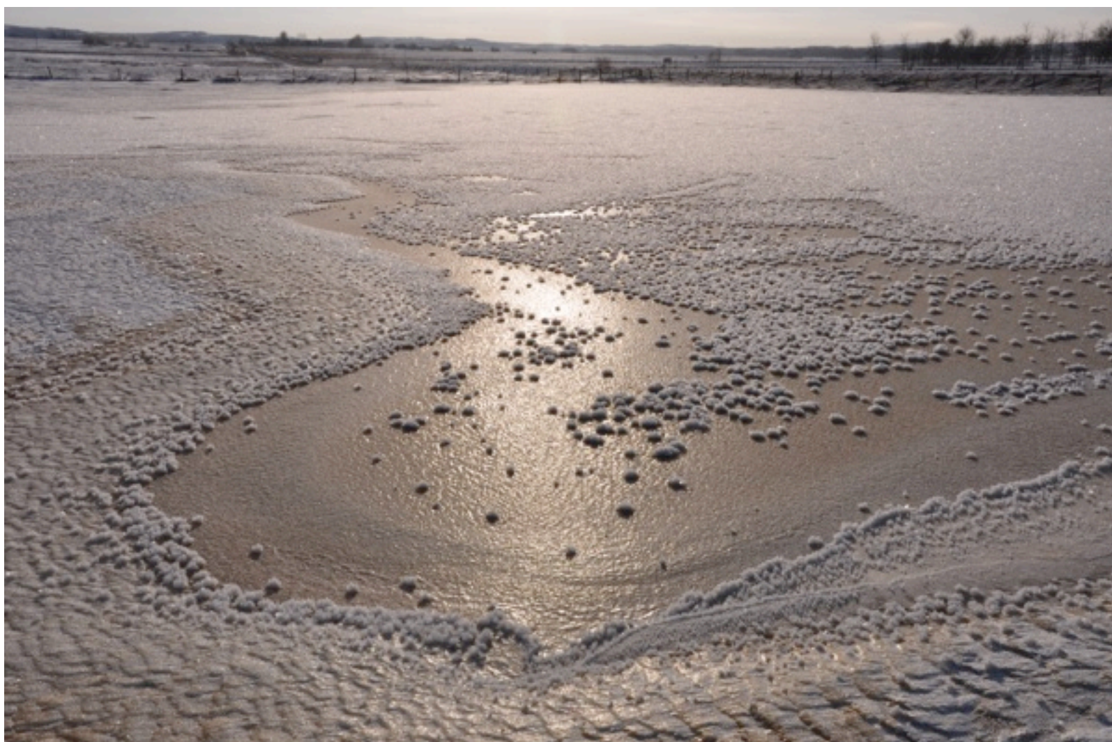
CARFF Field, March 2014.

Additional 2014 events will be published as soon as information becomes available.